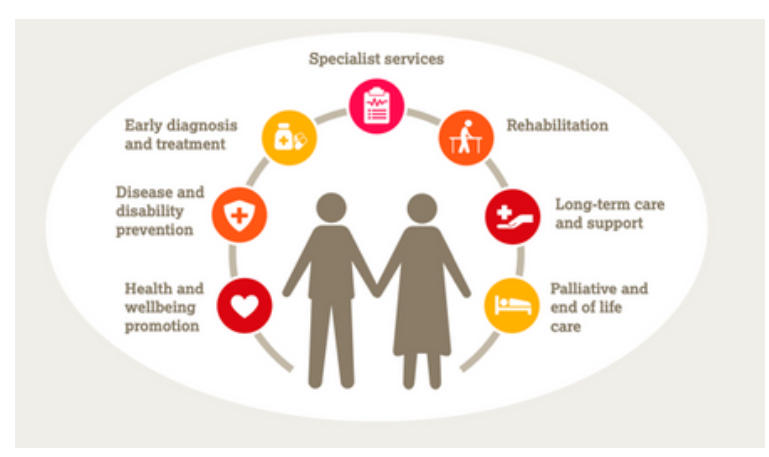
Figure One: Palliative care is part of the continuum of essential integrated care (3)

cooperation and coordination across health and social service systems at various levels, as well as with community networks, families, and those who are affected.