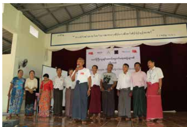
The National Older People's Federation of Myanmar meets to discuss social protection advocacy strategy and annual plans for Township Network Committees