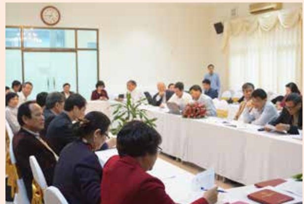
A national workshop on ISHC replication in Vietnam

From 2008, many stakeholders have visited and learned about the model, including an array of government representatives with a focus on MOLISA and Ministry of Health at local, district, provincial and national levels, the National Committee on Ageing and members of the National Assembly. Sharing the model and evidence of its impact and sustainability has led to participation by a growing number of implementing partners and funding sources and strengthened the political