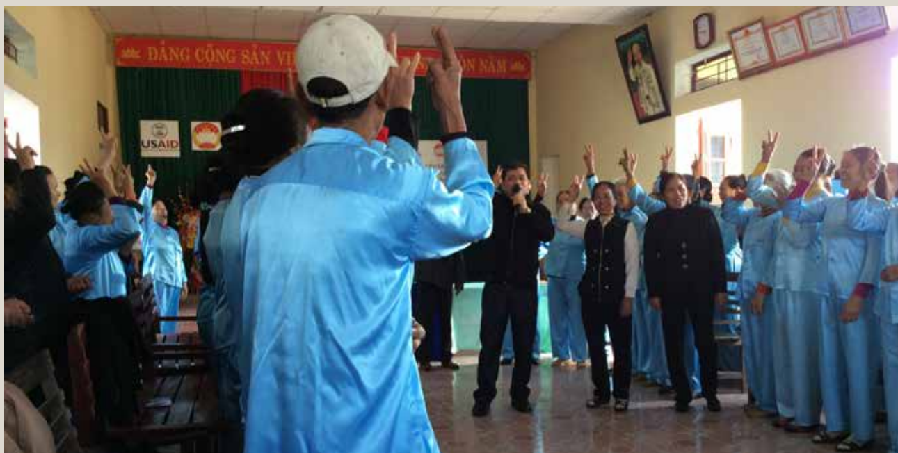
Monthly meeting in Vietnam