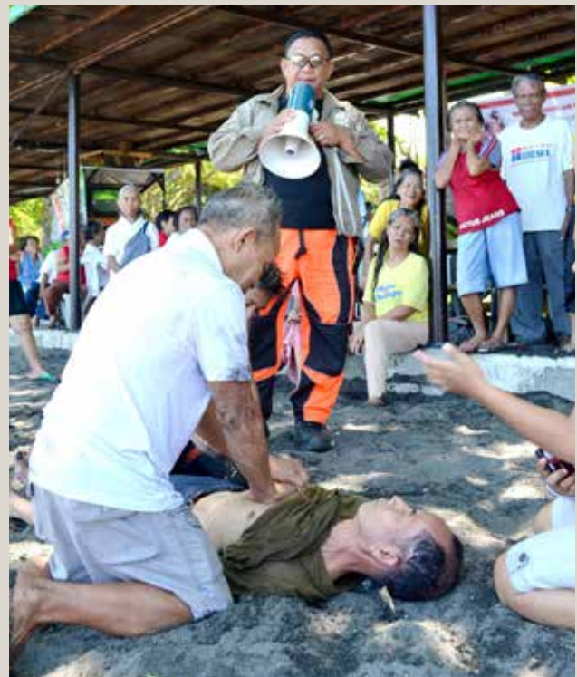
First aid and CPR training in the Philippines