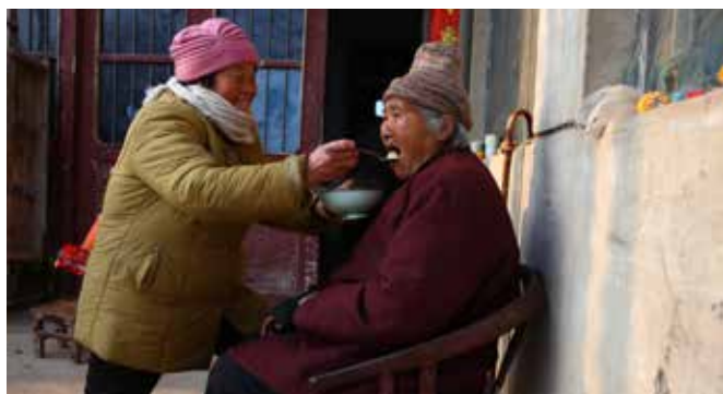
Chinese homecare volunteer provides support on activities of daily living (ADL)

Sustained funding which is most often the result of income generating activities and an initial investment in start-up funding and capacity building. In Vietnam, financial sustainability is generally achieved within two years of establishment. In some cases in China, regular funding agreements have been made with local government.