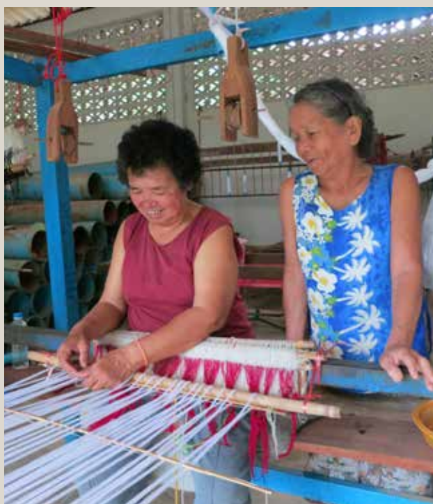
Weaving - a livelihood activity in Thailand