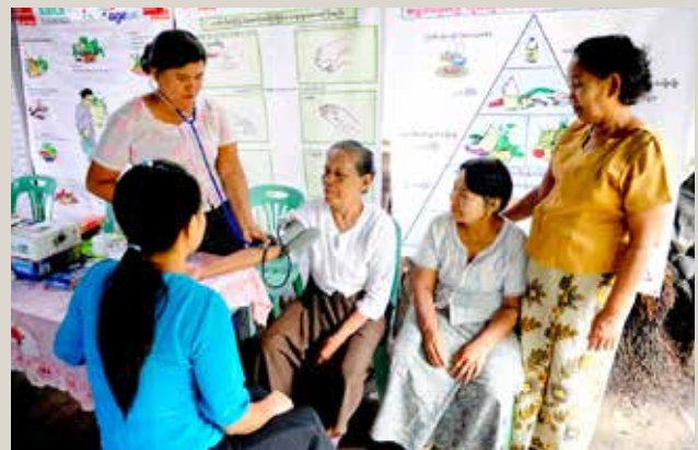
Health screening at an OPA in Myanmar