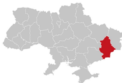
Map of Ukraine showing the Donetsk Oblast in red