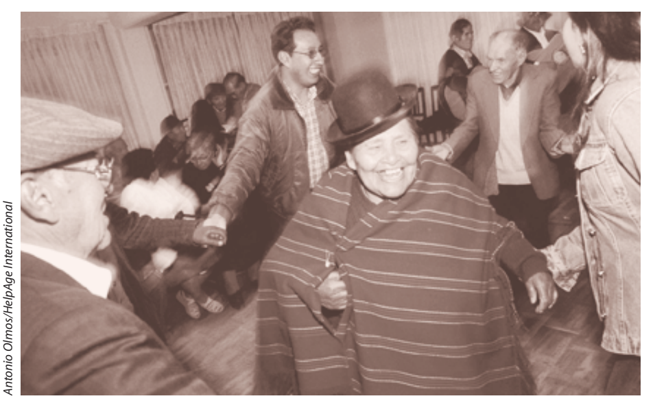
High spirits at the Asilo Quevedo older people's home in La Paz, Bolivia.

Keeping fit, staying active and involved, and learning to come to terms with loss can help to prevent depression.