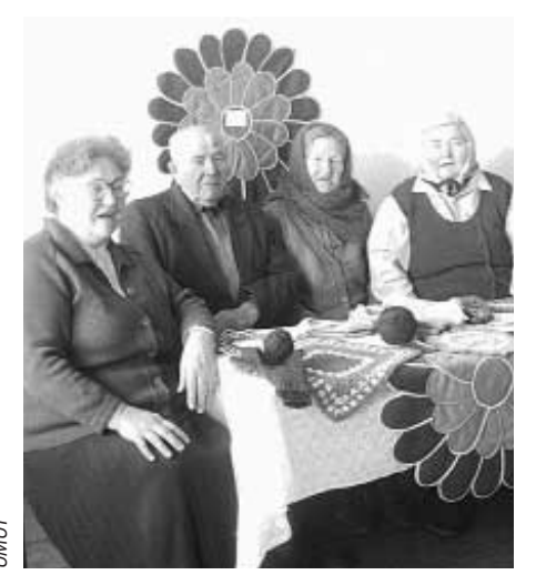
Members of the Bakyt Uyu self-help group, who specialise in spinning, knitting, sewing and weaving.