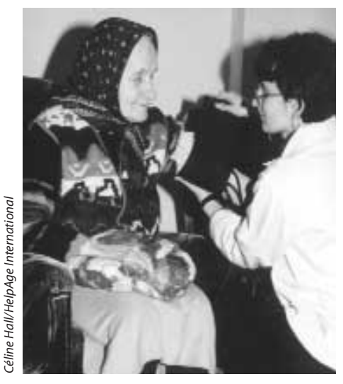
Care at a day centre run by the Timisoara branch of the Alzheimer Society Romania.

Dementia is an illness of the brain that particularly affects older people. This article looks at how to tell if someone has dementia and how to care for them.