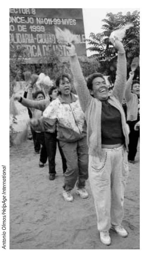
Aerobics in Villa El Salvador near Lima, Peru.

Older people's clubs on the outskirts of Lima, Peru are helping to improve members' health and self-esteem.