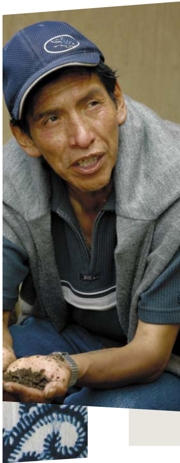
Tom Weller/HelpAge International