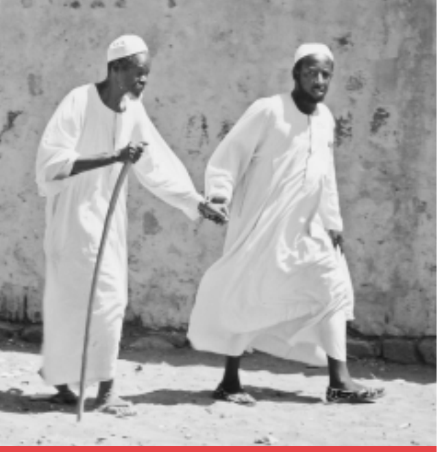
Helping hand in Sudan, where a study looks at attitudes.