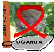
Health Nest Uganda