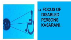
Focus of Disabled Persons Kasarani, Kenya