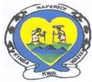
Magu Poverty Focus On Older People Rehabilitation Centre (MAPERECE)