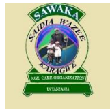
Saidia Wazee Karagwe (SAWAKA), Tanzania