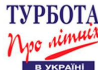
Turbota pro Litnih v Ukraini, Ukraine