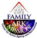
Family Ark Mission, Nigeria