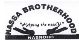
Nassa Brotherhood Programs, Tanzania