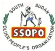
South Sudan Older People's Organization (SSOPO)