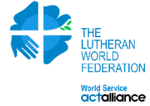
Lutheran World Federation