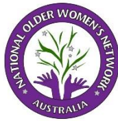
National Older Women's Network Australia