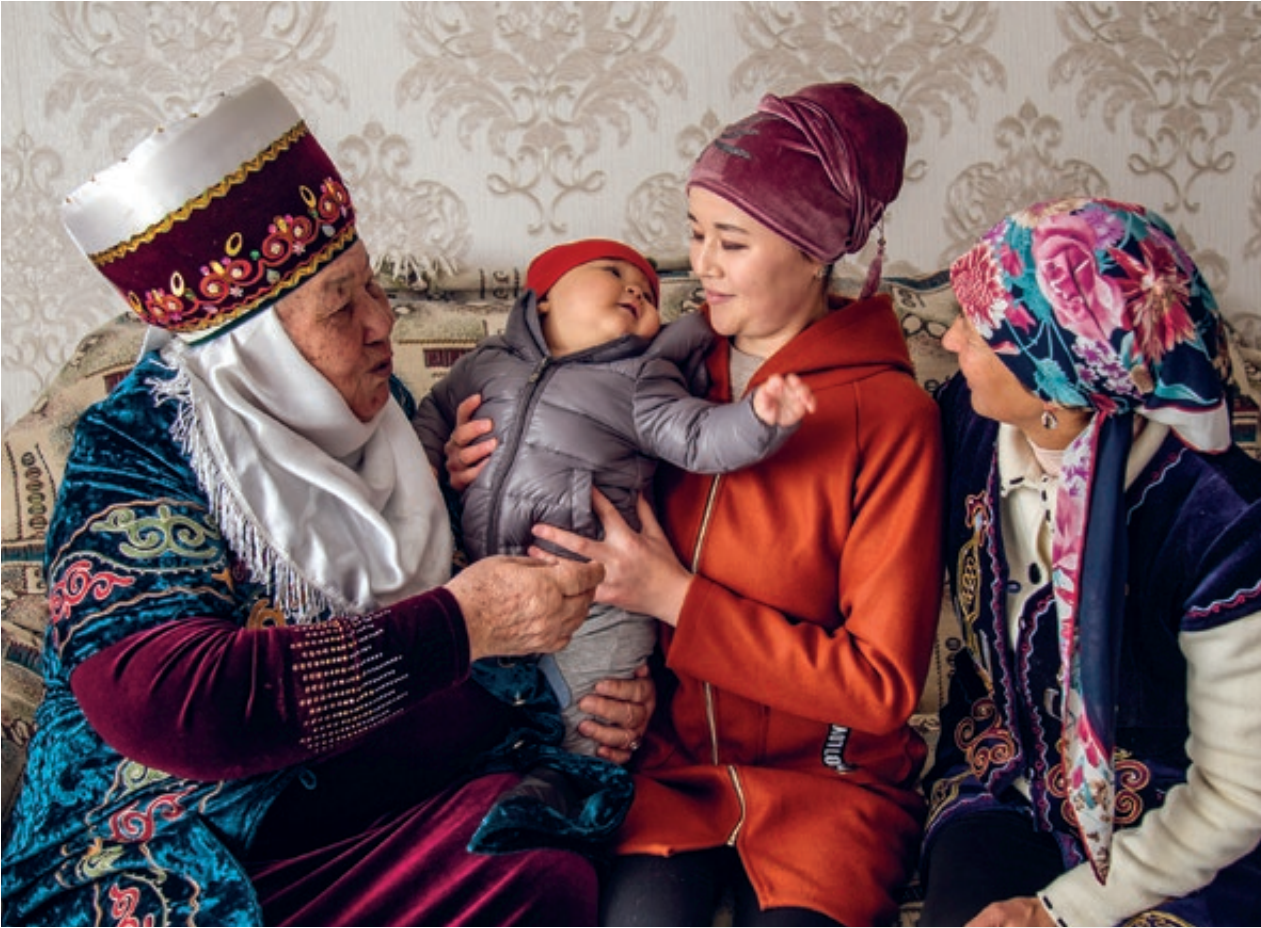
An older member of an intergenerational group shares the secrets of caring for children in Jeti-Oguz village, Kyrgyzstan