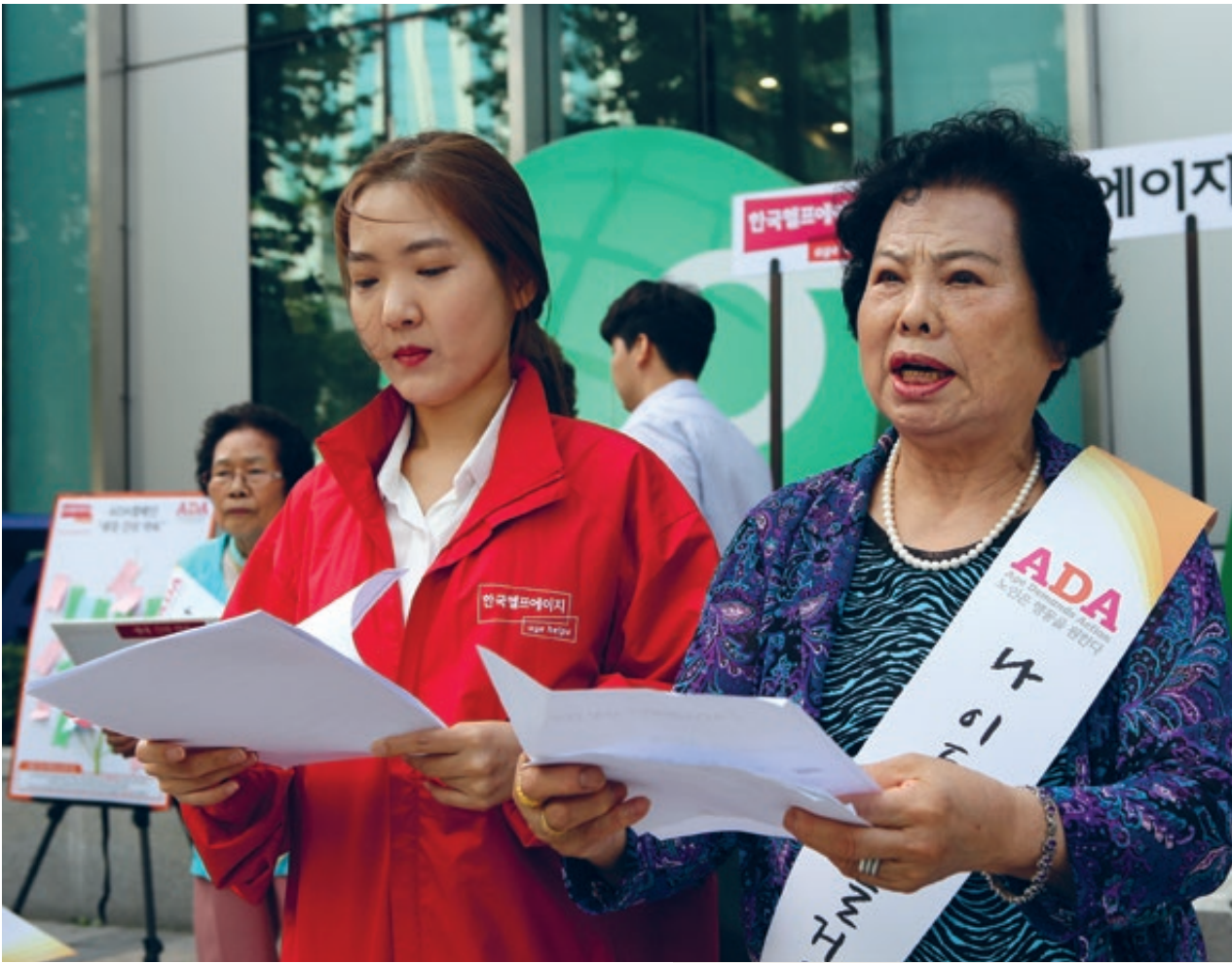
Age Demands Action partner, HelpAge Korea, joins the campaign to expose ageism on International Day of Older Persons 2019