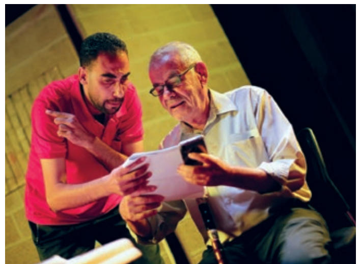
Older people in Gaza create their own theatre play to expose ageism

We will explore how population ageing intersects with other global trends (such as climate change, population pressure on resources, urbanization, and technology) and be alert to the potential impact on older people's rights and the opportunities for interventions with policy and decision makers to promote positive change.