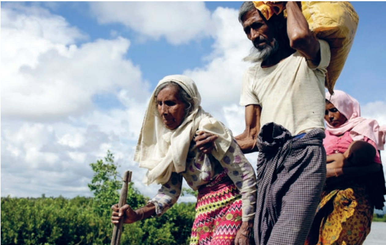
Older people from Myanmar flee their homes to Cox's Bazar in Bangladesh

The combined effect of trends like climate change, pressure on natural resources, protracted conflicts, the backlash against human rights, and reduced multilateralism will put pressure on international frameworks and priorities, profoundly affecting international development efforts. This could lead to increased inequality and limited capacity to tackle global trends. Older people will be disproportionately impacted, particularly those with lower levels of resilience or living in the poorest or most fragile communities.