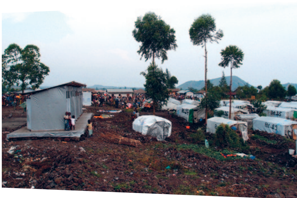
Gacheru Mama/HelpAge International

Several needs assessment methodologies do not consider the use of focus group interviews during the initial assessment processes. However such data collection methodologies are an important mechanism to give a voice to otherwise silent older people. Focus groups can also be used as an information source in triangulation, in order to avoid the risk of bias as discussed above.