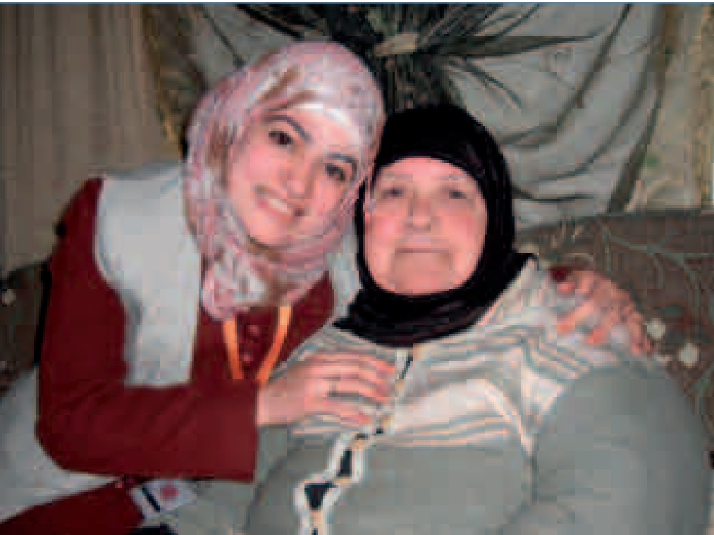
A woman in a Gaza refugee camp with her physiotherapist.