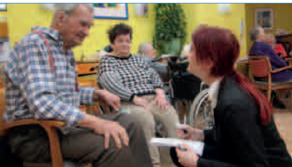
Residents and staff of a care home in Austria.