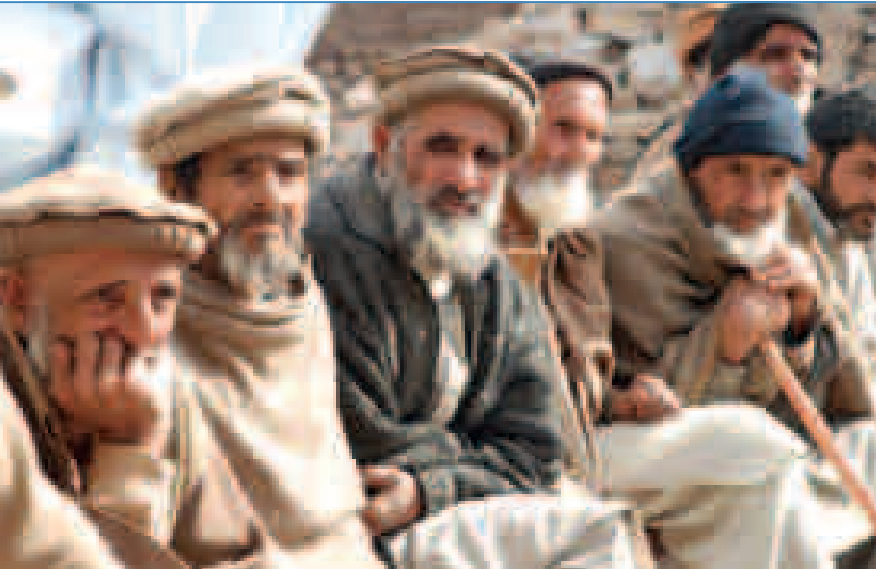
Meeting of an older people's association in Pakistan.