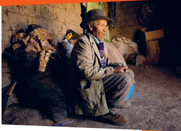
Older people living in poverty are among those most at risk of non-communicable diseases.