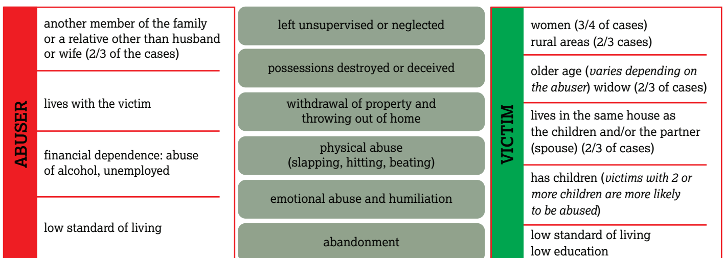
Figure 2. Features of violence against older people in the family

According to our results, domestic violence against older people is very widespread in Moldovan society. One in four of the older victims