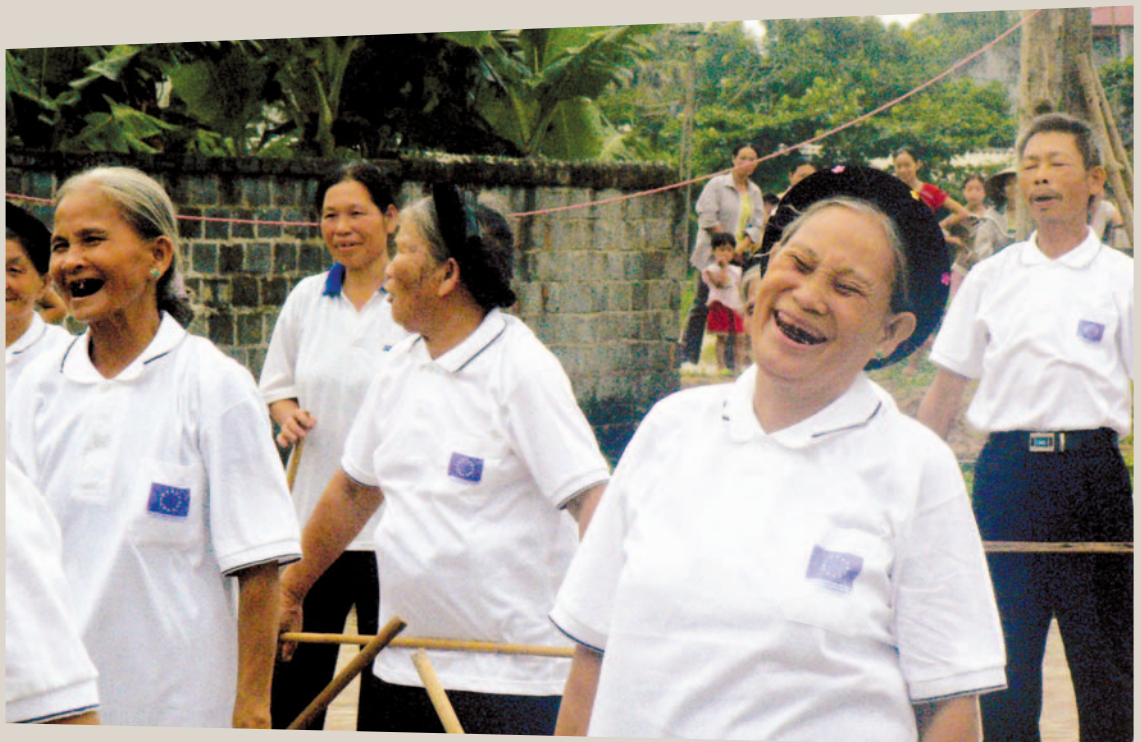
Judith Escribano/HelpAge International

The Sustainable Development Goals (SDGs), the global development framework succeeding the Millennium Development Goals (MDGs), will be ratified by the United Nations member states in September 2015. While ageing was not included in the MDGs, the post-2015 SDGs will be more comprehensive. The SDGs thus present an opportunity for addressing global ageing, particularly as they will influence donor funding, government planning and financial priorities, and policy development. Ageing can be included in the SDGs not only by mentioning older people as a vulnerable group but also by taking into account the dramatic population ageing occurring globally. Currently there is a draft of the SDGs which specifically mentions older people or age in several points, using phrases like "for all ages", "for all", "irrespective of age" and "older persons". This is seen strongly in the focus areas on ending poverty and hunger and reducing inequality as well as in the goal for healthy life and well-being for "all ages". These word choices are essential in ensuring the inclusion of older people. The SDG draft is in the inter-governmental discussion phase. We need to identify opportunities to engage with national governments and regional/sub-regional bodies and to seek out champion nations who actively support the ageing agenda.