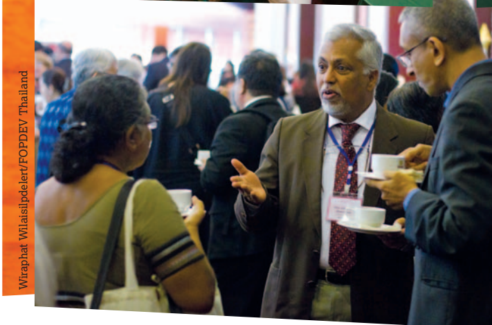
Wiraphat Waisitpedaleru/FOPDEV Thailand