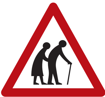
The symbol commonly used to denote older people implies weakness, dependence and impaired mobility.

What can be done? Advocacy and education of those purveying media content can pay off. Disseminating accurate, high-quality information is important: when an academic study is published, key messages should be shared with news outlets and on social media. Our messages need to be clear and avoid contributing to simplistic and negative perceptions.