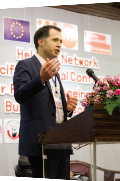
Wiraphat Wilaisijdelet/FOPDEV Thailand

The conference discussed the role of state-provided social protection to ensure the income security of poor older people. In particular, this includes social pensions, which are non-contributory state-financed benefits provided to older people. Several speakers viewed social pensions as an investment, citing studies which show that older people receiving a social pension spend much of it locally, boosting local economies, or use it to find work, start a business or support their families. Some touted it as a key tool in income redistribution, noting evidence of a decrease in poverty among households of older people receiving pensions. Others suggested that social pensions should be viewed as compensation for the years of contribution to the country's economy, particularly for those involved in informal sector work or women who contributed throughout their lives with unpaid domestic work or childrearing.