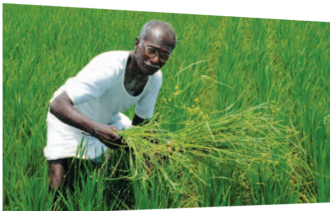
Judith Escribano/HelpAge International